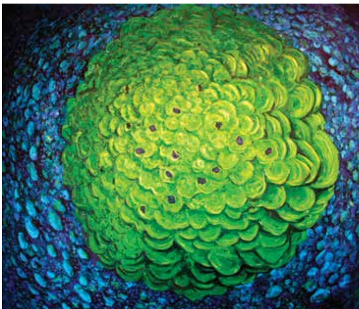
8 ABRAHAM ABEBE MESKEL FLOWERS 3 Acrylic on Canvas 70 x 175 cm